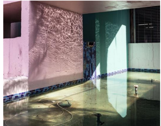
Anastasia Samoylova, Fountain , 2017, from the FloodZone series