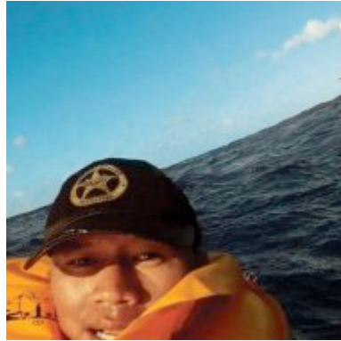
<img src="http://pixel.nymag.com/imgs/daily/vulture/2014/01/24/magazine/24-selfies-9.o.jpg/a_190x190.jpg" alt="" title=""/> 10: Plane crash: the self imperiled.