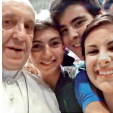
<img src="http://pixel.nymag.com/imgs/daily/vulture/2014/01/24/magazine/24-selfies-2.o.jpg/a_190x190.jpg" alt="" title=""/> 1: Francis and friends: holy selfie.