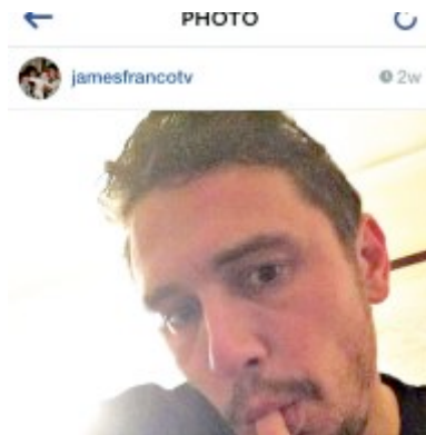
<img src="http://pixel.nymag.com/imgs/daily/vulture/2014/01/24/magazine/24-selfies-6.o.jpg/a_190x190.jpg" alt="" title=""/> 2: Franco: Selfies are "tools of communication."