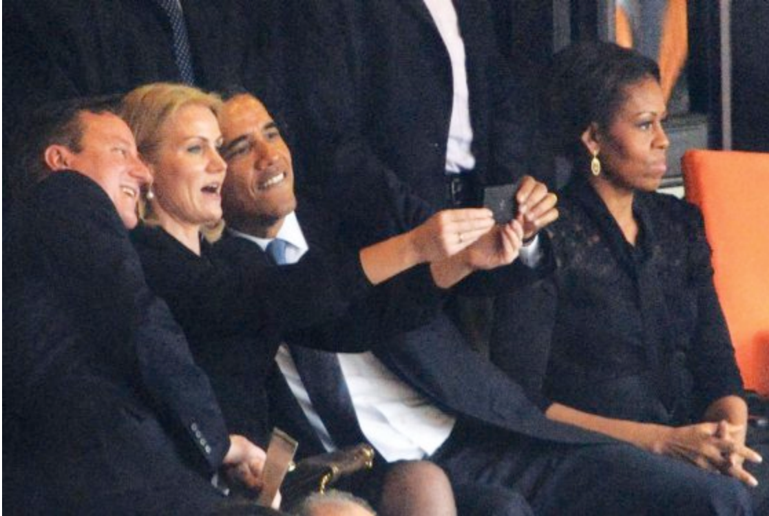
src="http://pixel.nymag.com/imgs/daily/vulture/2014/01/24/magazine/24-selfies-7.o.jpg/a_560x375.jpg" alt="" title=""/> 12: Obama et al.: "las meninas" selfie.

some peek into the person's unseen life. The less publicity-driven (non-Kardashian) celebrity Instagram and Twitter feeds are good for this, because those lives are usually closed off to us, and the small details seem extra-revelatory. How much they have been staged, of course, we will never know.