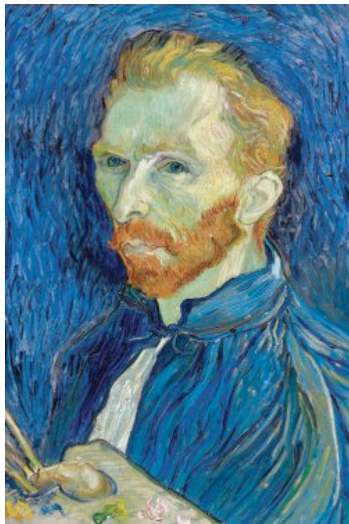
<img src="http://pixel.nymag.com/imgs/daily/vulture/2014/01/24/magazine/24-selfies-4.o.jpg/a_250x375.jpg" alt="" title=""/> 4: Van Gogh: proto-selfie.

Unlike traditional portraiture, selfies don't make pretentious claims. They go in the other direction—or no direction at all. Although theorists like Susan Sontag and Roland Barthes saw melancholy and signs of death in every photograph, selfies aren't for the ages. They're like the cartoon dog who, when asked what time it is, always says, "Now! Now! Now!"