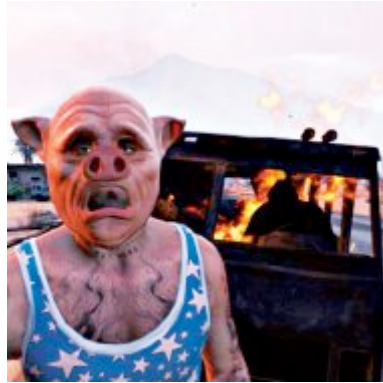
<img src="http://pixel.nymag.com/imgs/daily/vulture/2014/01/24/magazine/24-selfies-8.o.jpg/a_190x190.jpg" alt="" title=""/> 11: Avatar selfie: fictional character shoots self.