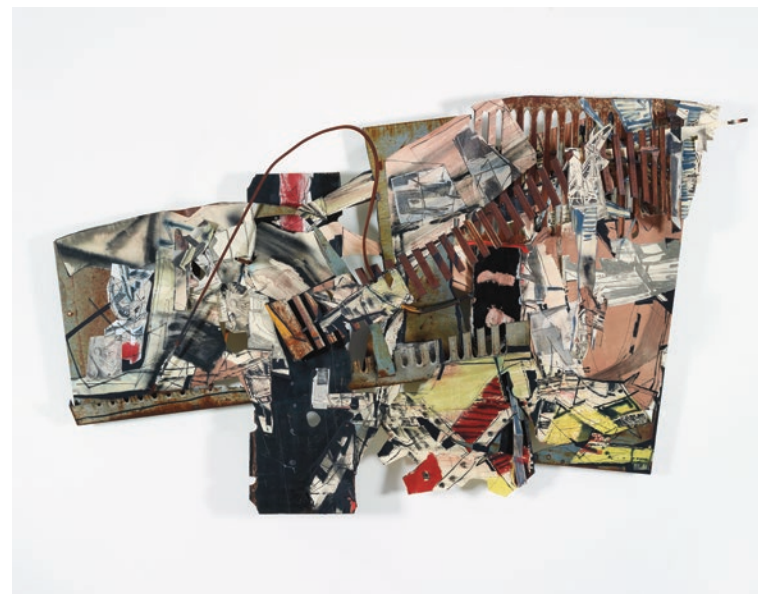
Iva Gueorguieva, Switching House , 2014

Each new body of work produced by Gueorguieva explores new territory and offers breakthroughs in form and color. Her understanding of the language and formal structures of painting bring her turbulent and provocative imagery under tension and control. Her approach