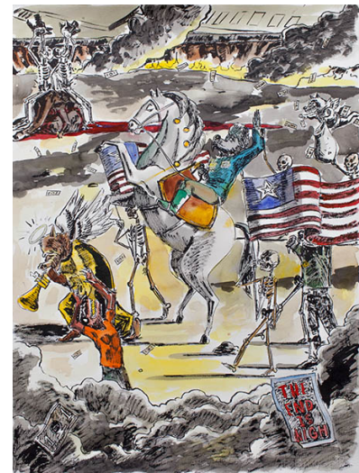
Mark Thomas Gibson, Last Dance (5) , 2016 Watercolor on paper; 30 x 22 inches

Black Pulp! and Woke! at USFCAM are supported in part by the USF Institute on Black Life. The USF Contemporary Art Museum is recognized by the State of Florida as a major cultural institution and receives funding through the State of Florida, Department of State, Division of Cultural Affairs, the Florida Council on Arts and Culture, the National Endowment for the Arts, and the Arts Council of Hillsborough County, Board of County Commissioners. The USF Contemporary Art Museum is accredited by the American Alliance of Museums.