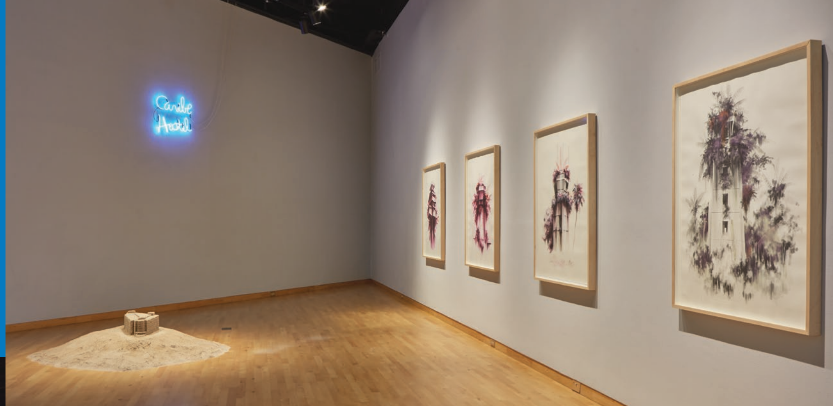
Installation view of Constant Storm . left: Yiyo Tirado Rivera, Castillo de arena I (Normandie)/Sand Castle I (Normandie) , 2019/2021; Caribe Hostil , 2020. right: Gamaliel Rodríguez, Figure 1827 (PSE) , 2018; Figure 1832 (PSE) , 2018; Figure 1851 (MAZ) , 2021; Figure 1852 (BQN) , 2021