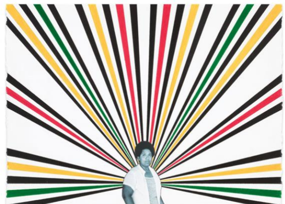
Rico Gatson, Audre #2 , 2021. Color pencil and photograph collage on paper. 22 x 30 inches. Courtesy of the artist and Miles McEnery Gallery.

Poor People's Art is curated by Christian Viveros-Fauné, CAM Curator-at-Large and organized by the USF Contemporary Art