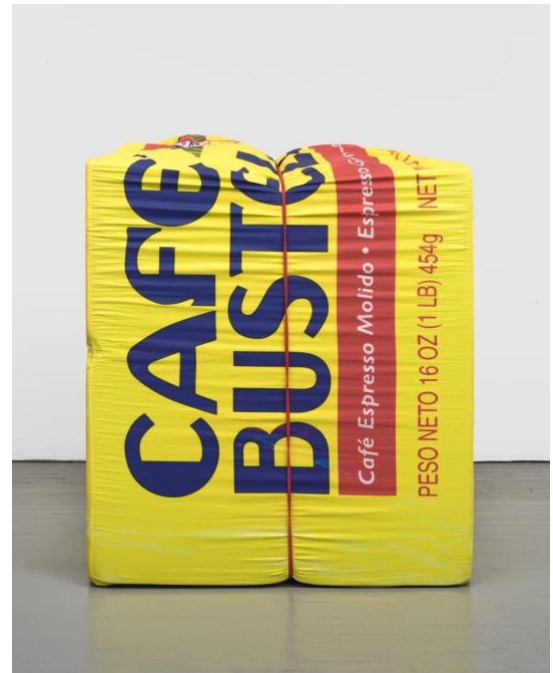
Lucía Hierro (b. 1987, New York, NY). 10oz. Café Bustelo , 2022. foam, digital print on cotton sateen, rubber band. 53 x 43 x 25 inches.

X Factor is curated by Christian Viveros-Fauné, CAM Curator at Large, and organized by USF Contemporary Art Museum, Tampa. X Factor is supported in part by the National Endowment for the Arts.